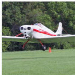
Fun flyer: A 1964 Stits Playboy