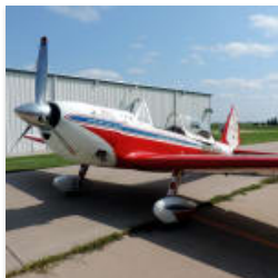
Rare deHavilland Super Chipmunk donated to museum