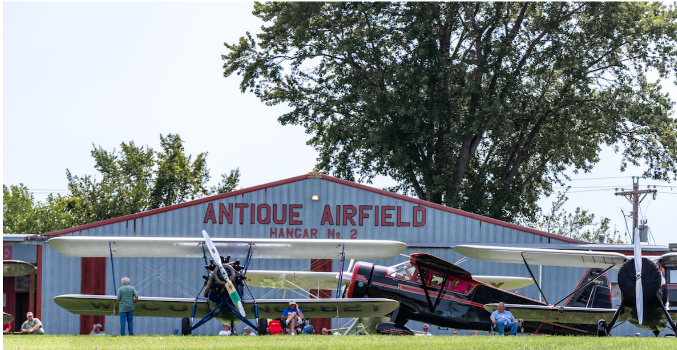
Antique Airfield

Between Aug. 28 and Sept. 2, 2019 – Labor Day Weekend – up to 25 pre-registered crews will fly antique/classic aircraft from all over the U.S. to rendezvous with hundreds of other antique and classic aircraft at famed Antique Airfield (IA27) near Blakesburg, Iowa.