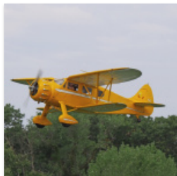
Back to Blakesburg