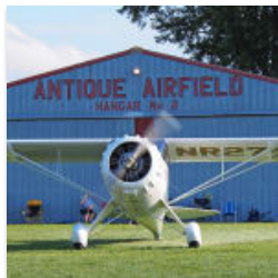
Blakesburg: Following the dream, preserving the memories