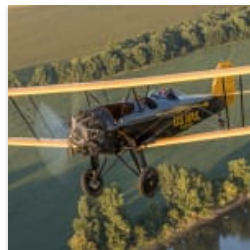
Flying through time